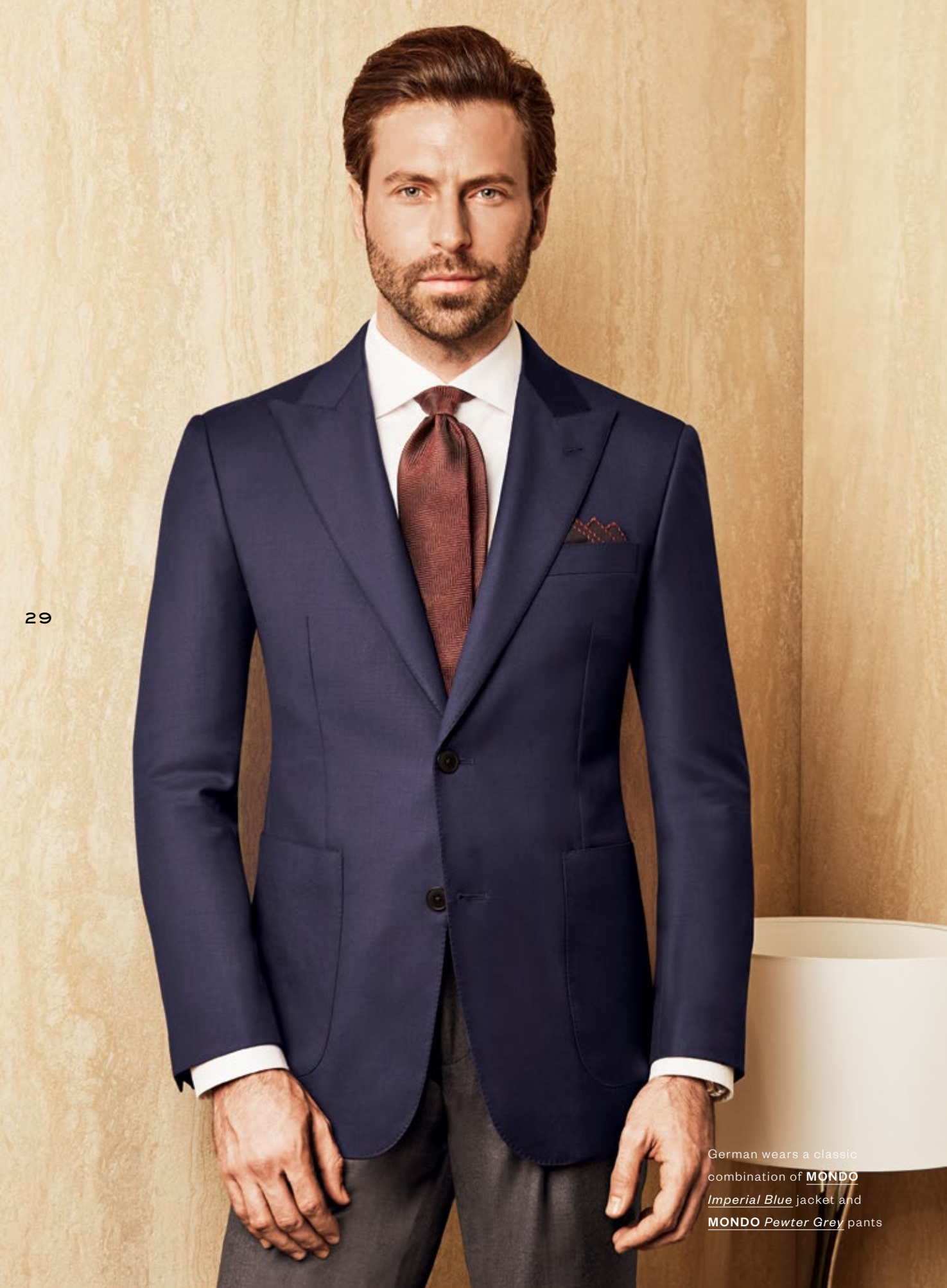
German wears a classic combination of MONDO Imperial Blue jacket and MONDO Pewter Grey pants