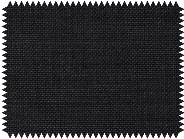
ENZO Blue Haze cut in a classic double breasted style