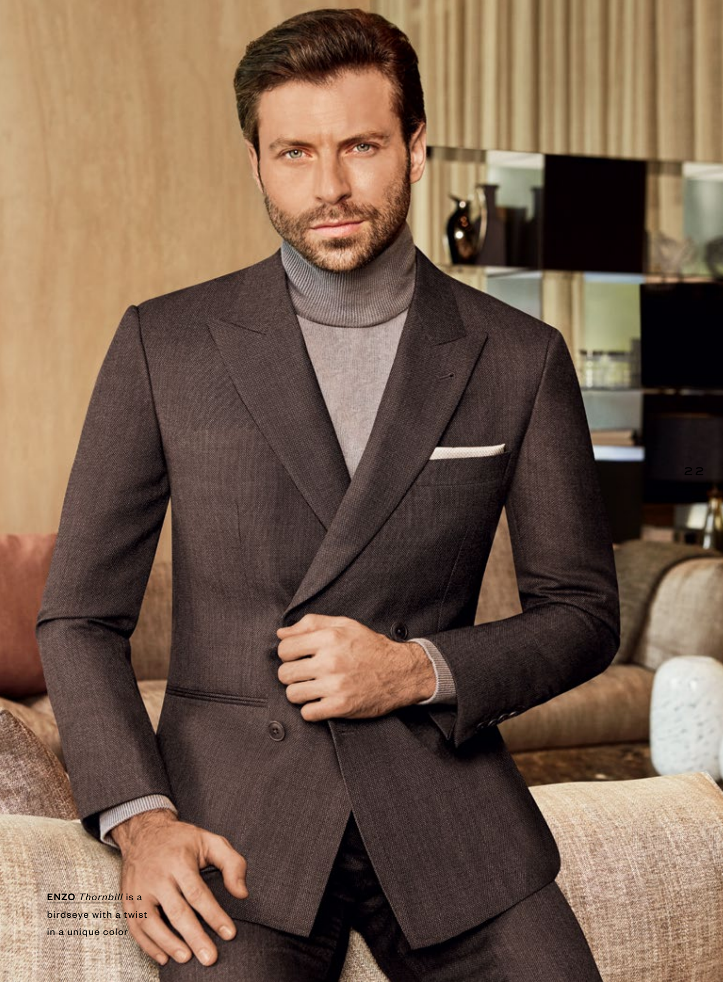
ENZO Thornbill is a birdseye with a twist in a unique color