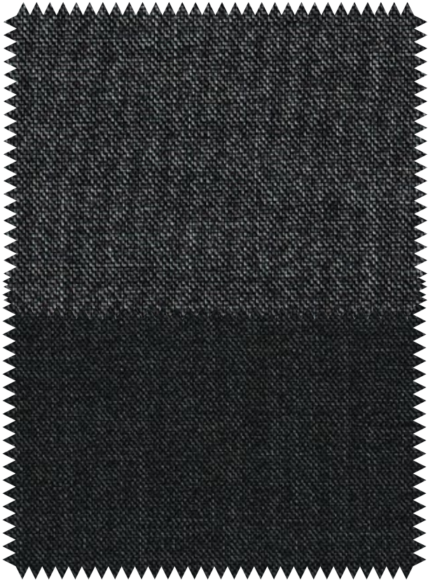
A Havana styled look with ENZO Harbor Grey