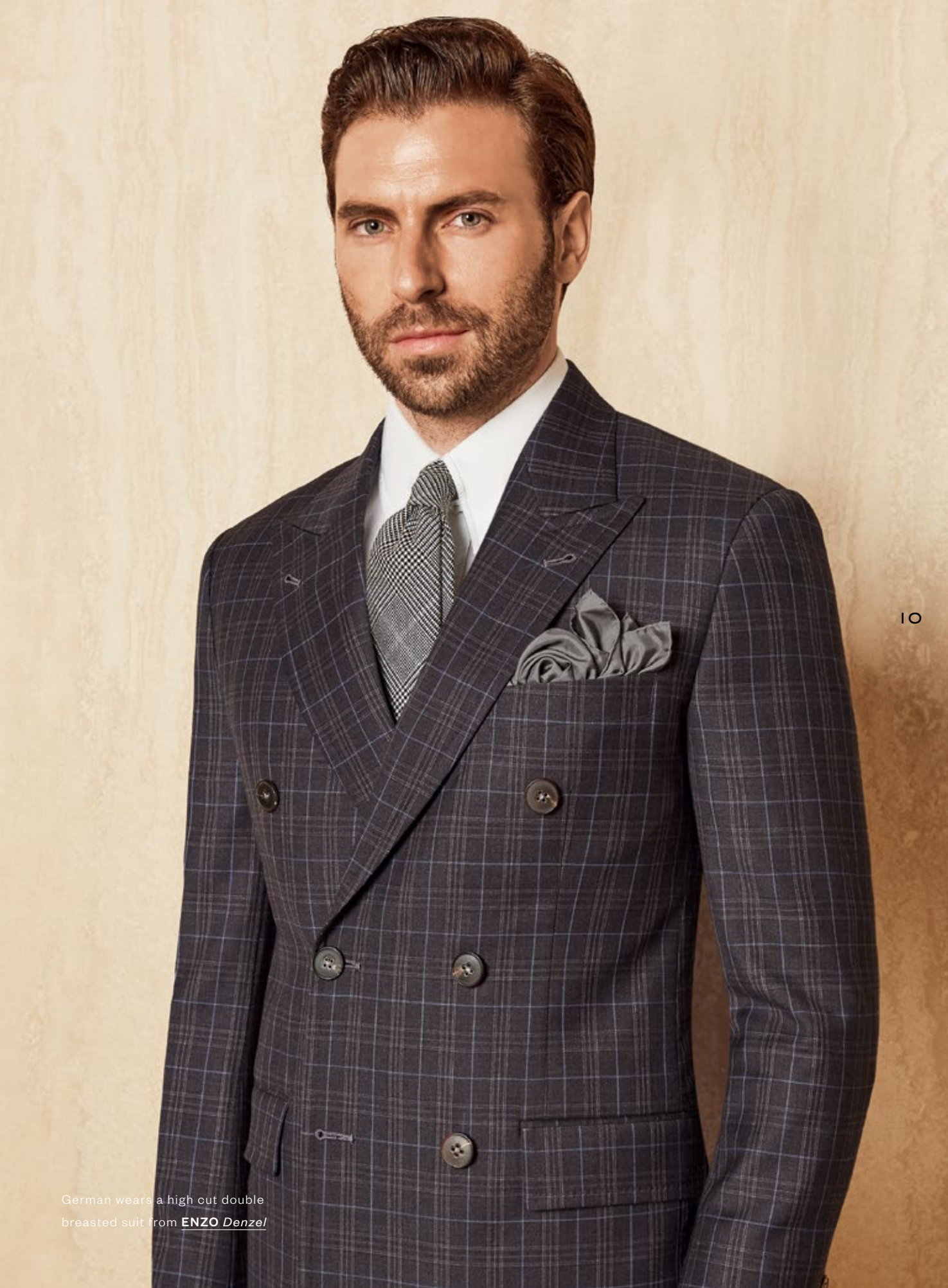
German wears a high cut double breasted suit from ENZO Denzel