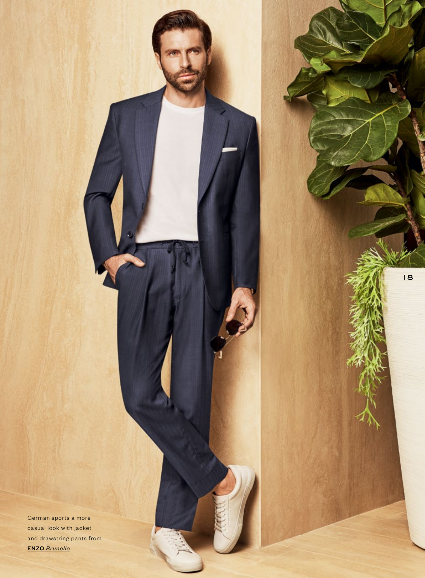
German sports a more casual look with jacket and drawstring pants from ENZO Brunello