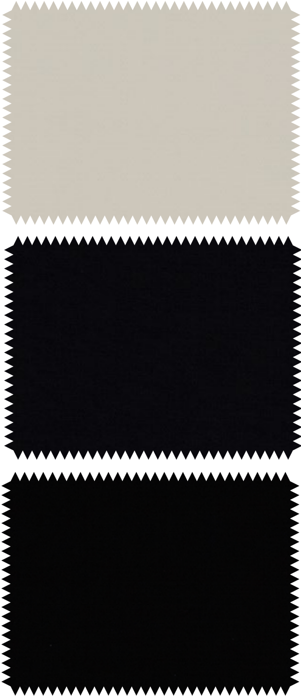
LUNA Bianco tuxedo jacket and LUNA Deep Black pants